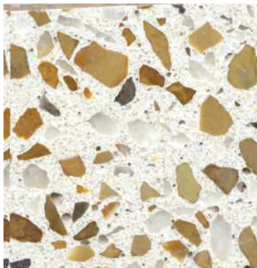
ARCHITECTURAL TERRAZZITE (6mm)