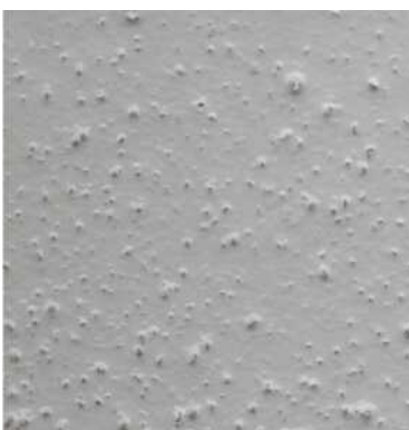
TRAXITE COLOURFINE (2mm)