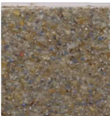
DECORATIVE TERRAZZITE (6mm)