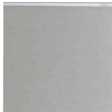
STERRATUFF EPOXY FLOORCOATING