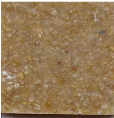
SURESHIELD INDUSTRIAL (8mm)