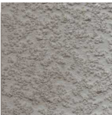
ELASTODECK 5000HT TRAFFIC DECK