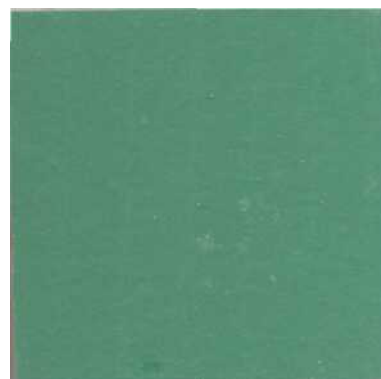
TERRATUFF SLE SELF LEVELLER

These samples are examples only, Final textures and colours may vary.