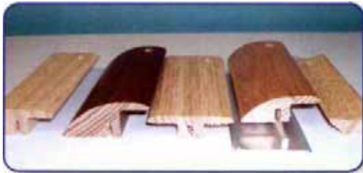
QEP Natures Edge - Nosings, Joiners, Corners