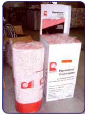
Roberts Harmony Wood Floor Cushion Underlayment offers soundproofing, moisture proofing and moisture release