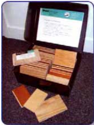
The broad range of Armstrong Hartco Timber ranges are available