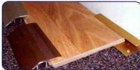
Bronze, Brass, Aluminium, Trims for wooden floor ramps, expansion joints etc