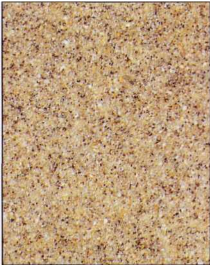
SALT & PEPPER