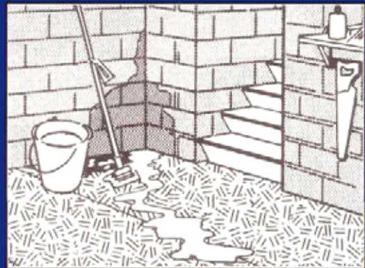
Damp walls and floors can be sealed and waterproofed from the inside.