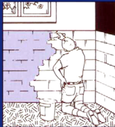
Aquaguard 101 makes waterproofing as easy as painting